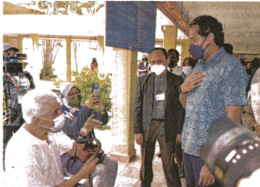
KHAIRY JAMALUDDIN (kanan) semasa mengadakan lawatan kerja di Hospital Raja Permaisuri Bainun (HRPB), Ipoh semalam.

"Disebabkan itu penggunaan katil di wad Unit Rawatan Rapi (ICU) tidak penuh macam dahulu," katanya pada sidang akhbar selepas mengadakan lawatan kerja ke Hospital Raja Permaisuri