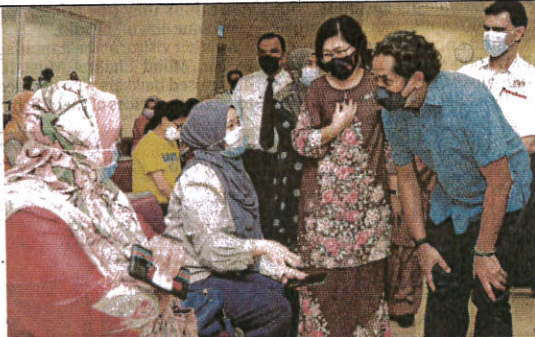
Khairy Jamaluddin speaking to people during a work visit at the Raja Permaisuri Bainun Hospital in Ipoh yesterday.

"We need to look into this new variant that is occurring in other