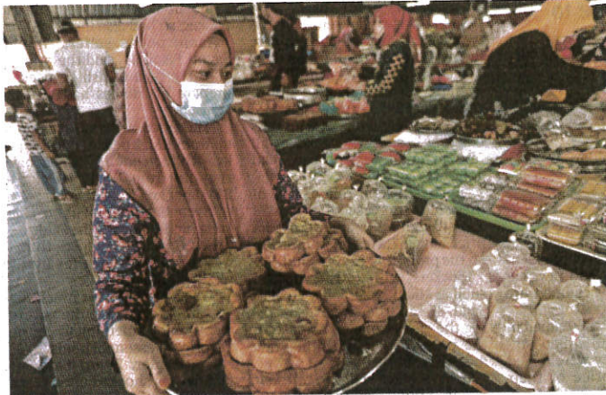
A seller carrying a tray of 'kuih bakar' at the Batu Enam Ramadan bazaar in Kuala Terengganu yesterday.

Meanwhile, data on CovidNow showed that new cases, deaths, hospital admissions, intensive care unit (ICU) admissions and active cases were all on a down-