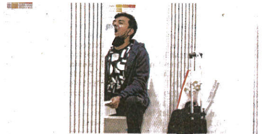
PENGENBARA dari luar negara melakukan ujian saringan Covid-19 selepas kerajaan Malaysia membuka semula sempadan negara bermula 1 April lalu.

Selain HRPB, Khairy Jamaluddin turut melawat ke Hospital Batu Gajah, dekat sini bagi meninjau wad 'Long Covid' dan Rehabilitasi Hospital Batu Gajah yang pertama diwujudkan di negeri Perak di bawah Kluster Hospital Ipoh.