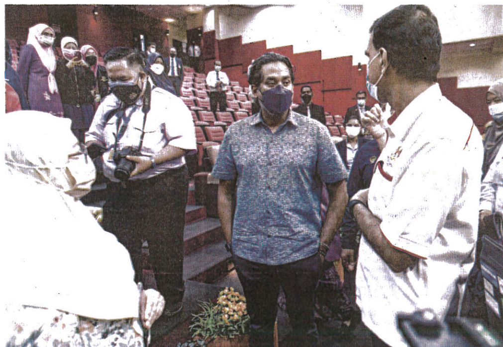
Khairy speaking to officials and staff during his visit to the Raja Permaisuri Bainun Hospital yesterday.

The national Covid-19 infectivity rate (Rt value) was 0.86, with Selangor registering the highest at 1.03 and Kelantan the lowest at 0.68. - Bernama