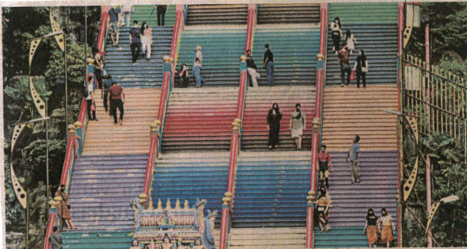
ORANG ramai mengambil peluang bergambar dan melawat kawasan menarik di sekitar kuil di Batu Caves dengan mematuhi SOP yang ditetapkan kerajaan.

AKHBAR : HARIAN METRO MUKA SURAT : 6 RUANGAN : COVID-19